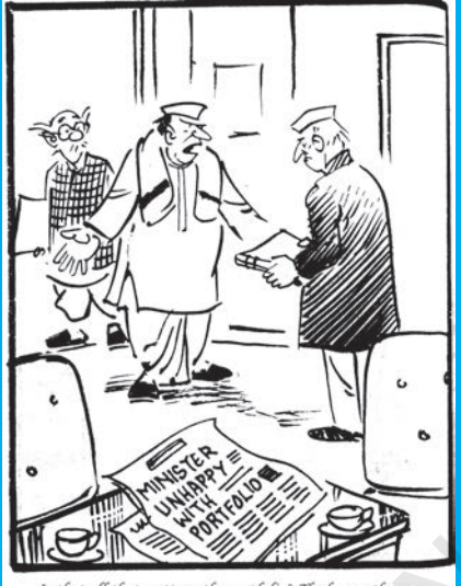
Is that all that matters, the portfolio? The house, the car, the servants, travel, the foreign trips, the security, the secretaries, etc., don't they mean anything to you?

Why do people want to be ministers? This cartoon seems to suggest that it is only for perks and status! Then why is there competition for some portfolios?