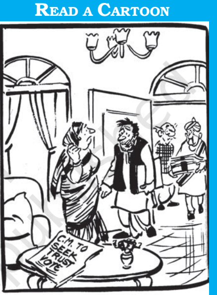
My troubles are not over - I won the confidence vote!

In the first place, these developments have resulted in a growing discretionary role of the President in the selection of Prime Ministers. Secondly, the coalitional nature of Indian politics in this period has necessitated much more consultation between political partners, leading to erosion of prime ministerial authority. Thirdly, it has also brought restrictions on various prerogatives of the Prime Minister like choosing the ministers and deciding their ranks and portfolios. Fourthly, even the policies and programmes of the government cannot be decided by the Prime